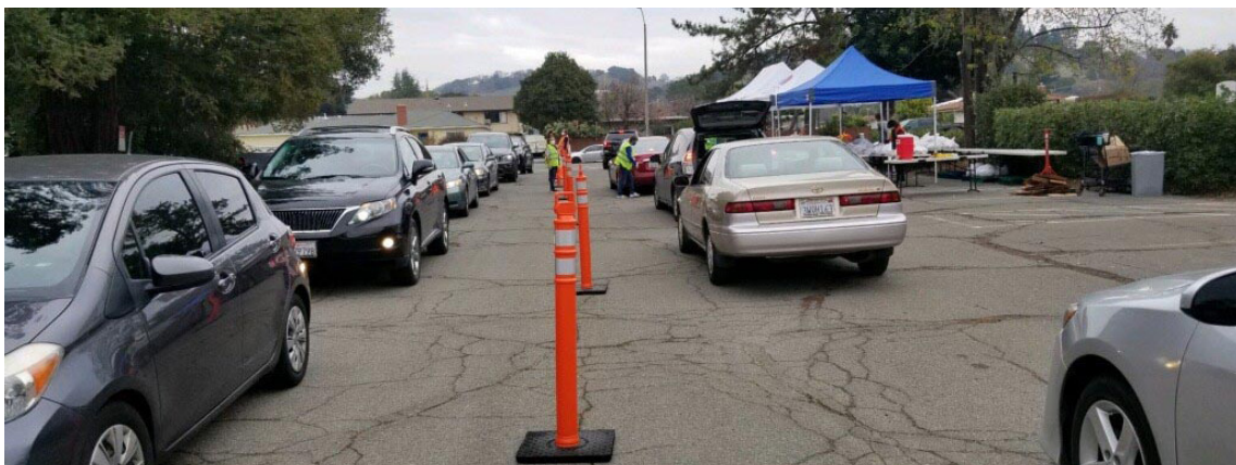
Our Food Pantry Program serves hundreds of local residents each week.